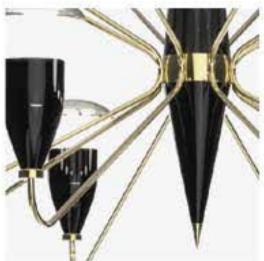
Black & Gold