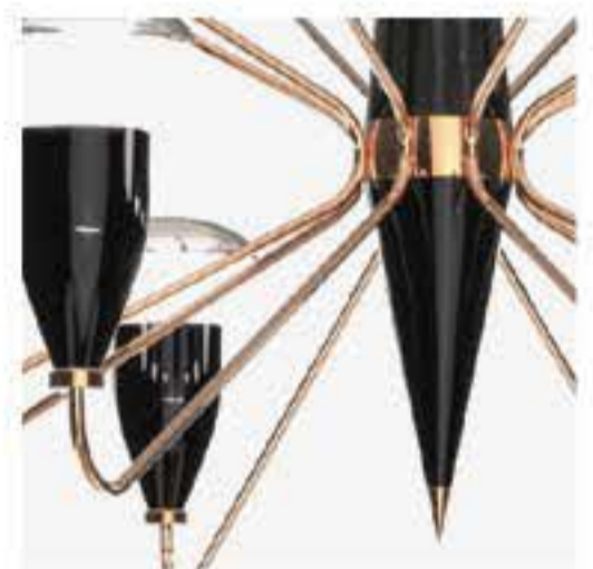
Black & Copper