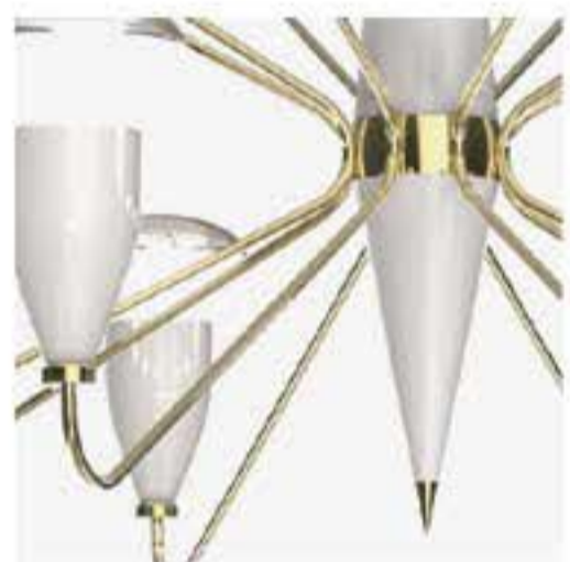
White & Gold