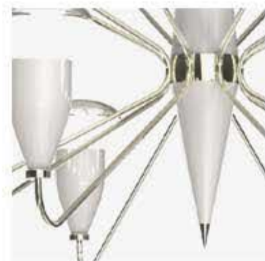
White & Nickel